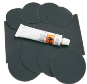
Catch Bag Repair Kit (600041)