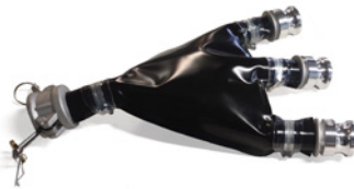
Distributor, 3-Way [Camlock 1 1/2" Skt x1, Plg x3] (SP0157)