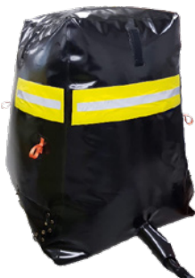
Catch Bag [Camlock 1 1/2" Plug] (LB0076/001)