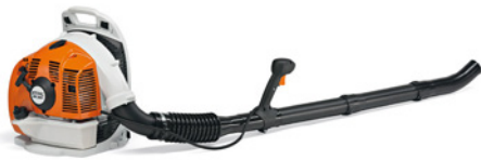
Stihl BR 350 Petrol Backpack Leaf Blower With coupling adapter [Camlock 1 1/2" Plug] (SP0158)