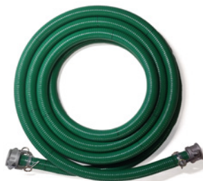
Green Hose, 10m [Camlock 1 1/2" Socket x2] (HS-07-02-10-31-31)